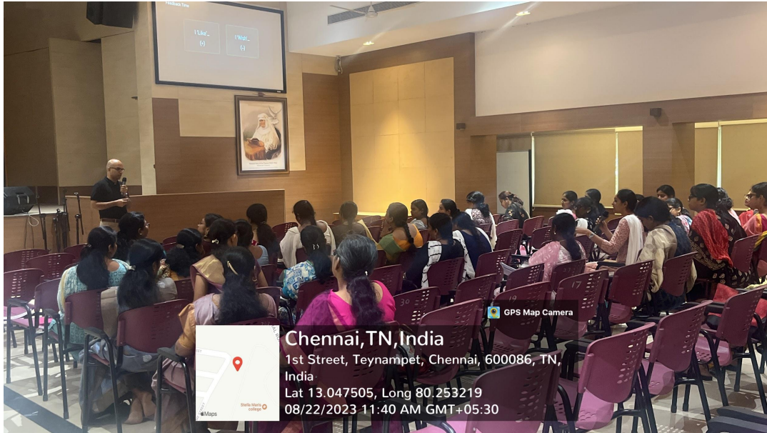
Participants During Day 2

Finally a few teachers shared their views and ideas as to how challenging it would be to put storytelling in everyday presentations. Some faculty from the social sciences felt that storytelling could be implemented in their classrooms.