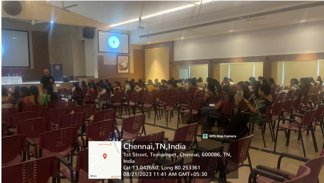
Participants During Day 1

The activity taught how people’s attention can be captured through storytelling in the quickest way, keeping it simple, tight and with emotions. To discover the structure of the story he suggested that every story is ‘ nested ’ in a Situation , an inherent Resistance ‘ hinders ’ the further development and a ‘ conscious effort ’ is made to Resolve it which means every structure must have a S-C-R (Situation-Complication -Resolution).